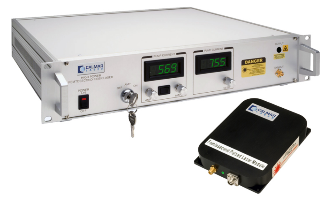
Figure 3 Examples of passively mode locked laser packages offered by Calmar Laser

A fiber laser system can easily be rack mounted, or placed as a module inside customer equipment. Access is not required as the fiber laser will stay aligned for the life of the laser.