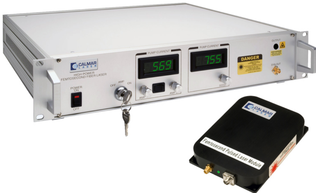
Figure 3 Examples of passively mode locked laser packages offered by Calmar Laser

A fiber laser system can easily be rack mounted, or placed as a module inside customer equipment. Access is not required as the fiber laser will stay aligned for the life of the laser.